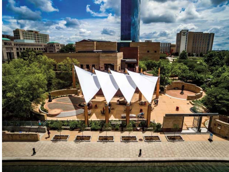
The rear exterior of the Eiteljorg Museum in Indianapolis, Indiana.

Each Month We Ask Leading Museum Curators About What's Going On In Their World.